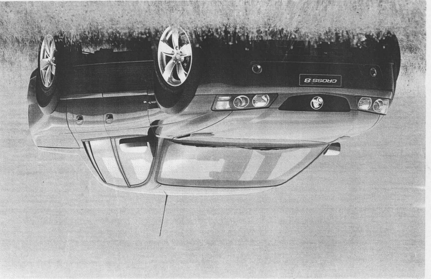
Cross 8 - Holden's all-wheel-drive recreational crossover vehicle