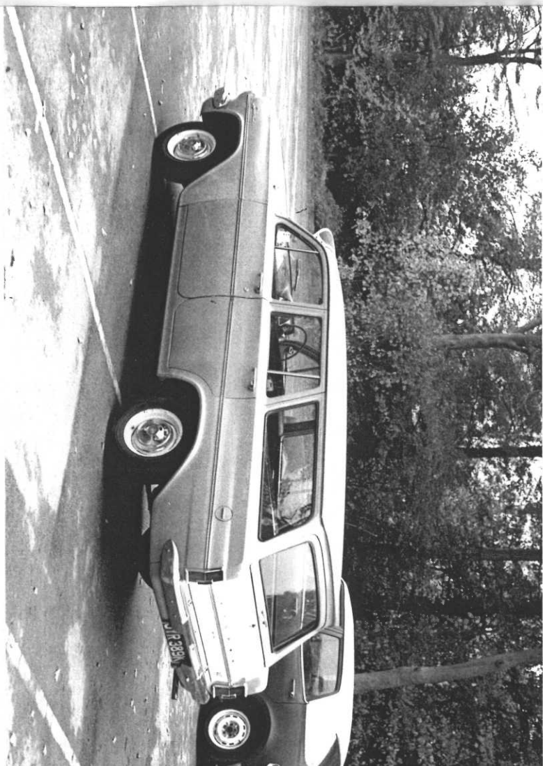
Before the restoration work

bumper, and of course off with the wings. I must say now, that in all honesty, not one nut, bolt, or screw, gave me one bit of trouble, Some welding was required to lock wings at the door end, top and bottom, myself adapting the metal and Colin welding it in place.