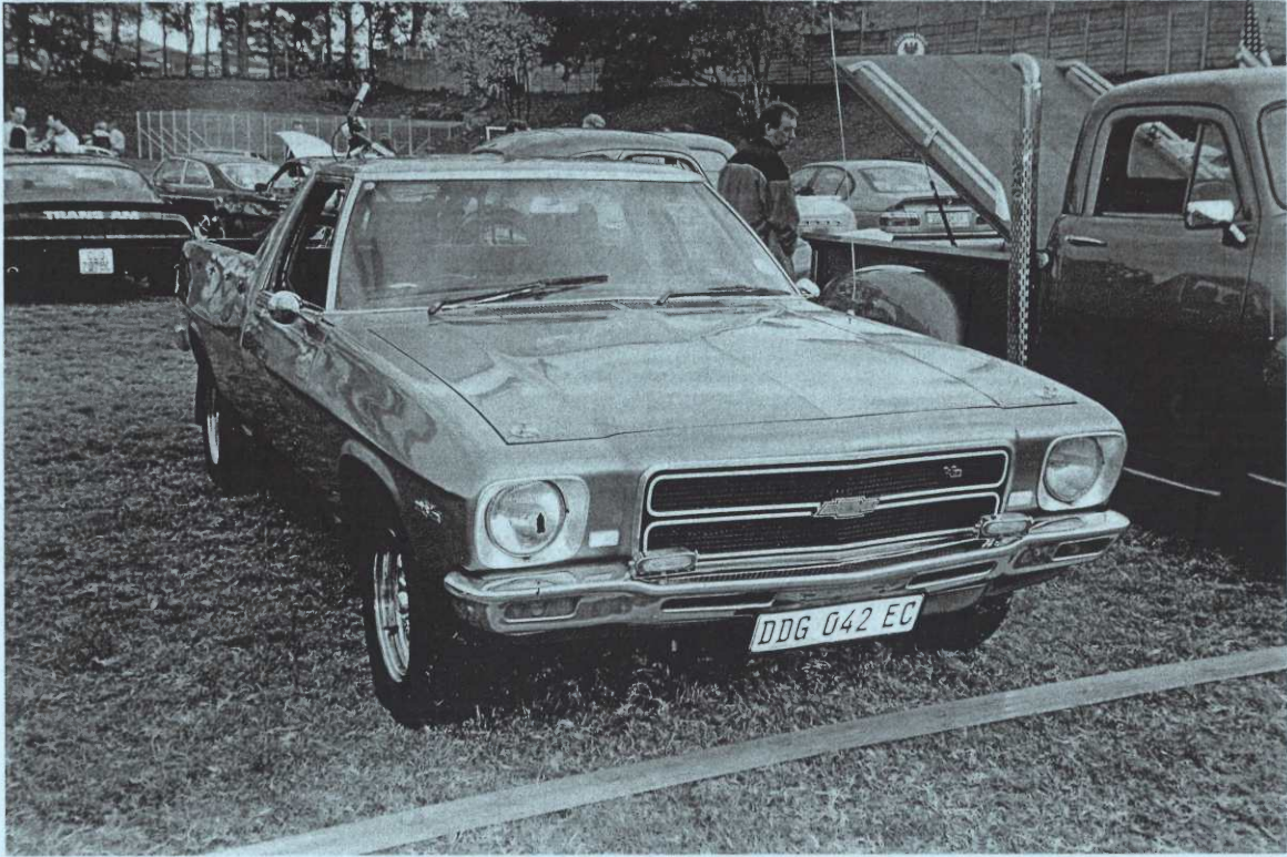
A Chevrolet AQ El Camino in East London, South Africa. Apart from the Grille and the GM 4.1 Litre 6 cyl engine built in Port Elizabeth this is the same as the Holden HQ.